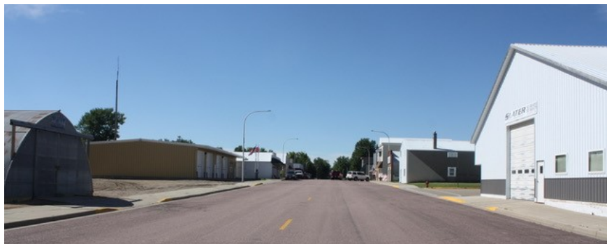
Facing south from north end of main street