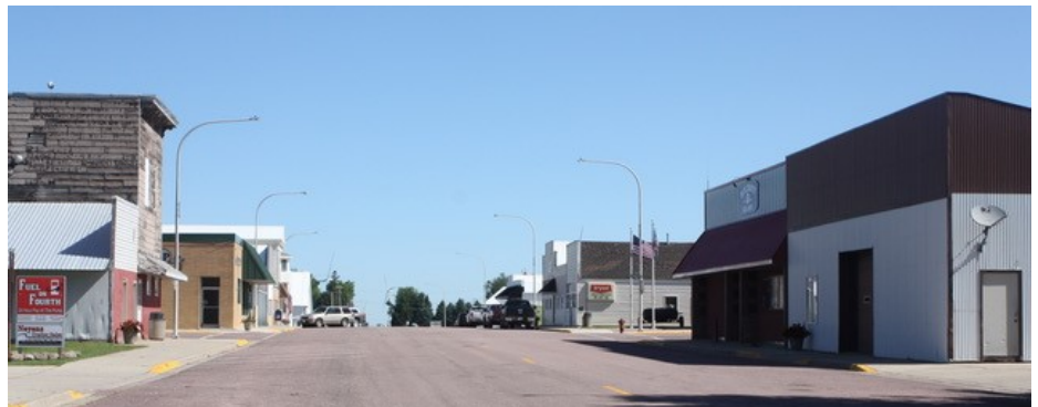
Facing north from south end of main street