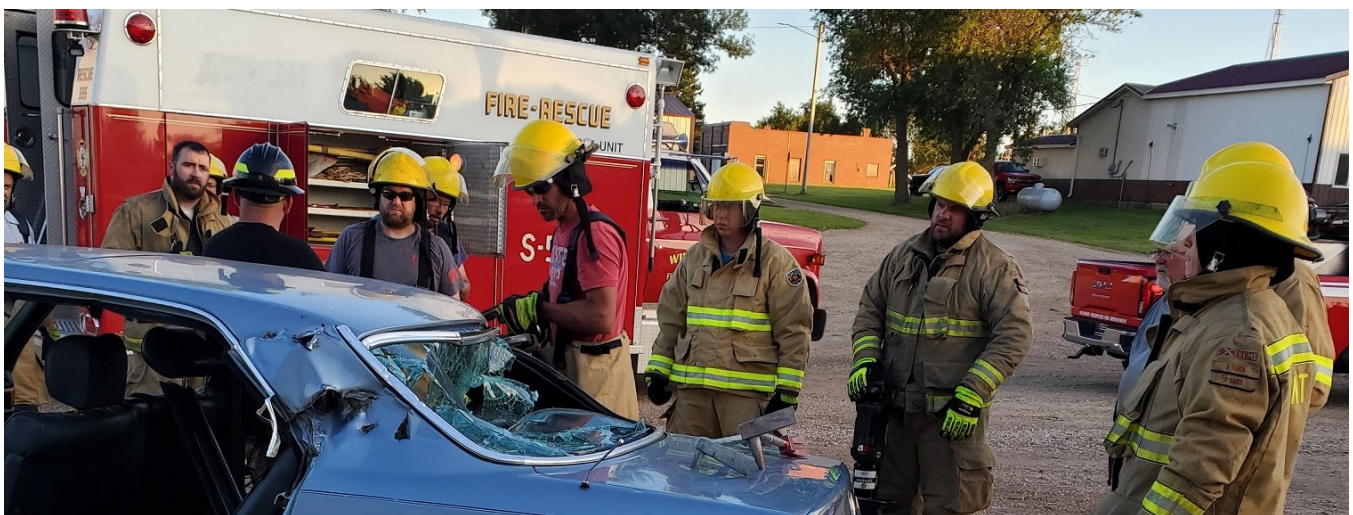
Training session with the new extrication equipment & some of the new turnout gear purchased over the last year

Battery operated extrication tools—brand new from FEMA grant and matching funds from Wilmont Relief Association—thank you for the donations towards this