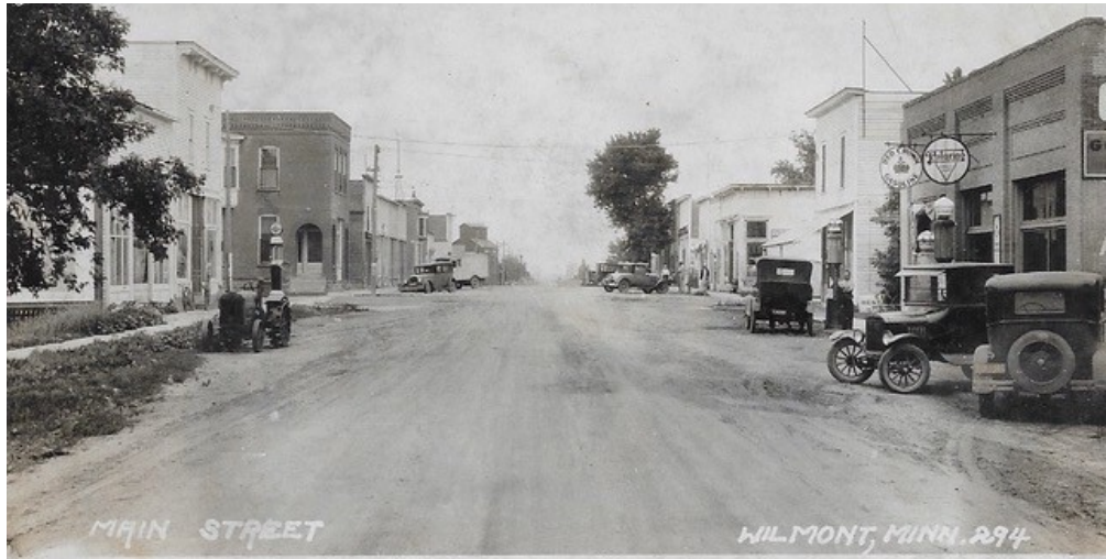
1920s view of main street